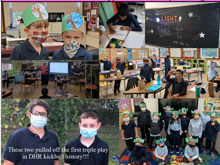
These two pulled off the first triple play in DHR kickball history!!!