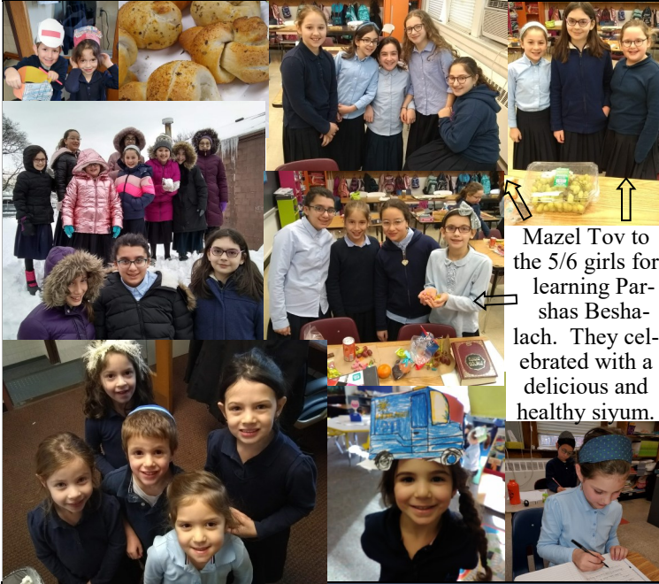
Mazel Tov to the 5/6 girls for learning Parshas Beshalach. They celebrated with a delicious and healthy siyum.